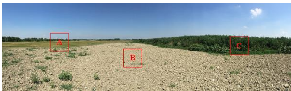
Figure 2. Closed landfill: [A] human transported material; [B] reconstituted soil; [C] natural vegetation on reconstituted soil.

These results demonstrate how the reconstitution technology can convert the environmental and agronomic conditions from soil having severe limitation - due to poor vegetation and anthropogenic materials -, to a condition of moderate limitations. This change allowed to restore an abandoned area, lead to productivity and to environmental and forest prosperity. The soil improvements allow area to be