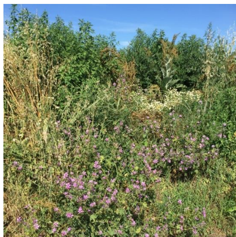
Figure 3. Natural vegetation on reconstituted soil.

a new ecosystem. In the area actually, they are planted more than 5000 species of native trees and shrubs to support revegetation and animal repopulation. Planting, already tried - before reconstitution - without any success, has been possible thanks to reconstituted soils properties, such as soil structure, high organic matter, increase root restricting layer, high fertility. These conditions wouldn't have been obtained only with soil tillage and fertilizations as many of the most important requirement to restore this area are unchangeable before reconstitution. The spontaneous recolonization occurred in the reconstituted soils (Figure 3) before planting gives evidence of fertility of reconstituted soils in comparison with human transported materials (Figure 4).